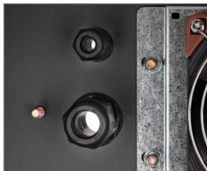
Cable entries with seal