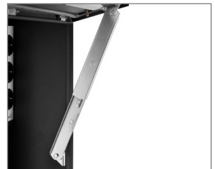
stable fixing mechanism